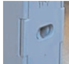
* Ergonomic Lift